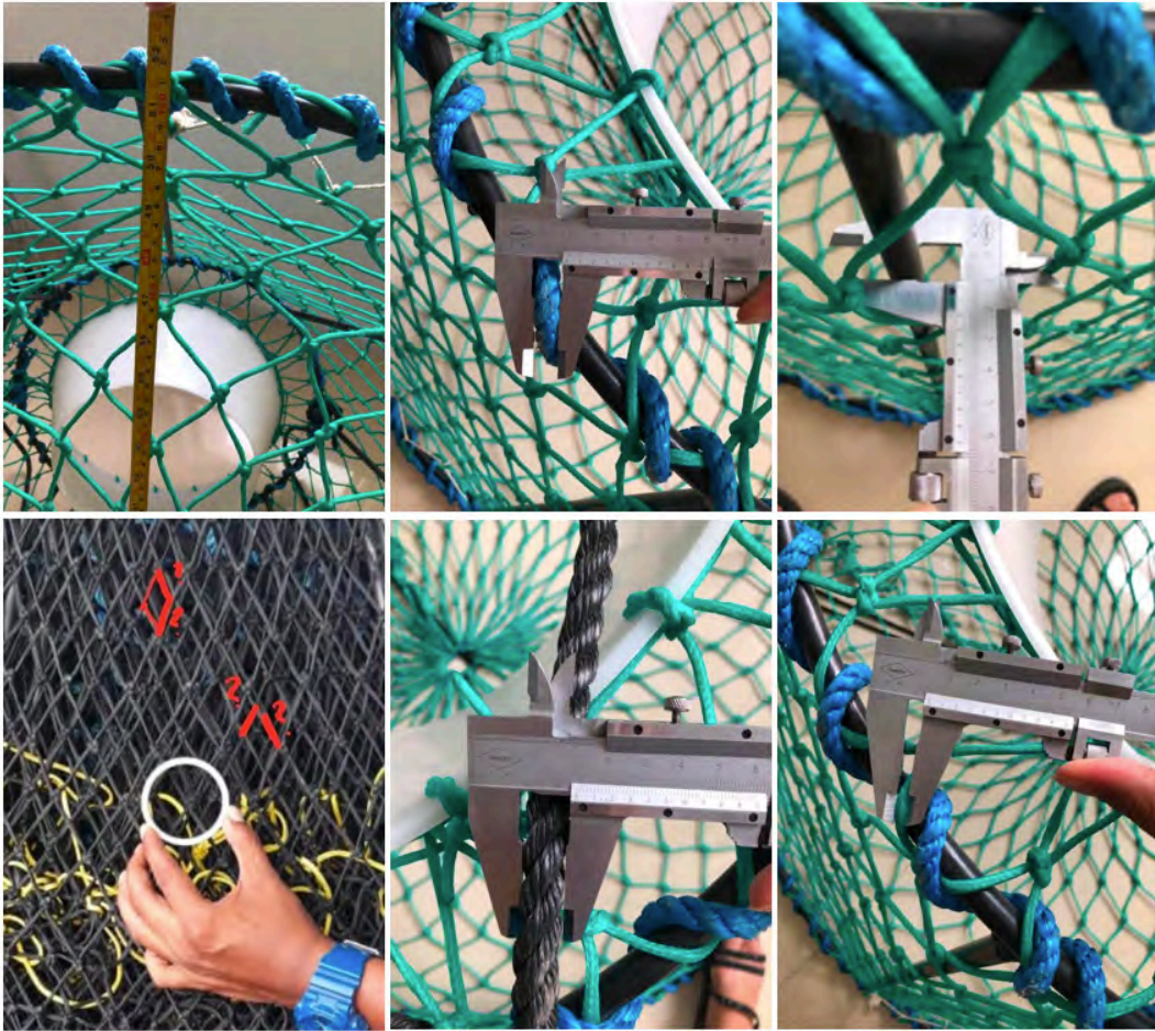
Figure B1: Trap measurements