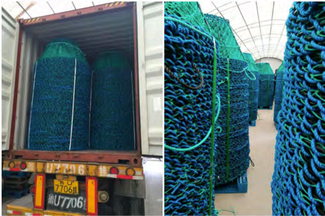
Figure B2: Traps store and stack