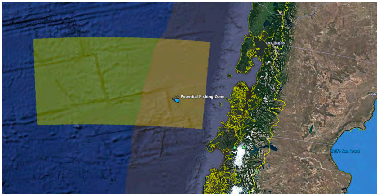
Figure 5: Map of the Southeast Pacific Ocean and South American continent shows the Chile Rise spreading center. Icon: Fishing ground suitable for deploy fishing sets.

The fishing strategy presented for Chile Rise is designed to answer questions raised by the exploratory surveys carried out by the Cook Islands in Foundation Seamount Chain, as well as similar questions arose from the depletion experiments described in this proposal (section 4.2) but for species inhabiting Chile Rise. The results obtained from exploratory fishing in Chile Rise should help the SC to detect rapid CPUE depletion areas and suggest a range of appropriate precautionary reference point. The proposal in this region attempts to answer two apriori questions: