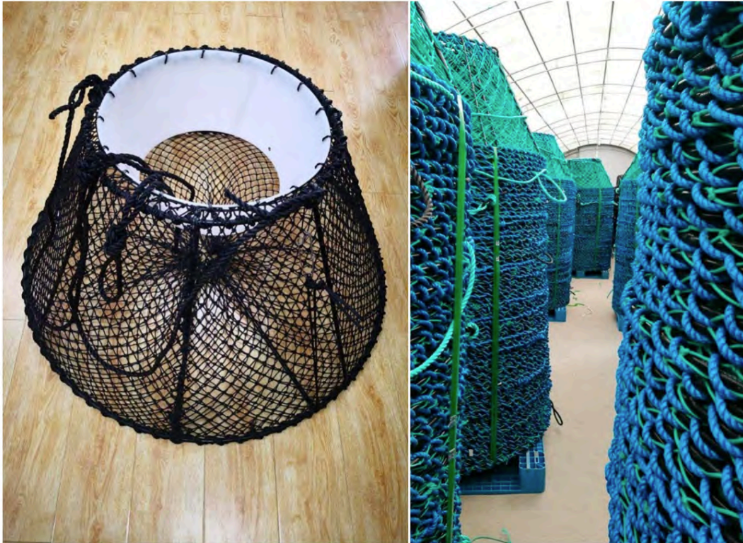
Figure 3: Design of traps proposed to be used during the Chilean exploratory potting fishing.