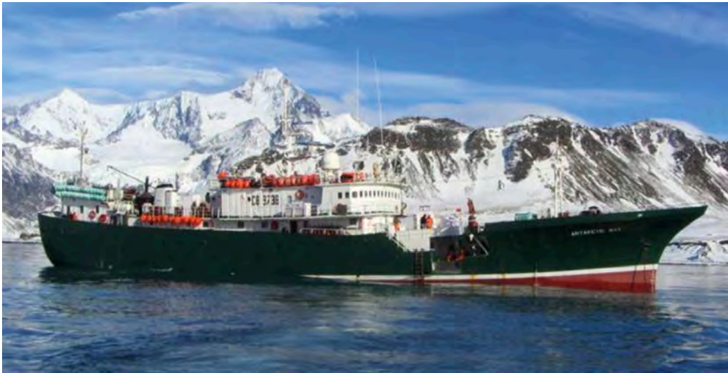
Figure 1: Fishing vessel Antarctic Bay.

14b-2020, the fishing gear intended by FV Antarctic Bay shall deploy an average of 100 traps per string from a setting and hauling setup of 500 traps per day.