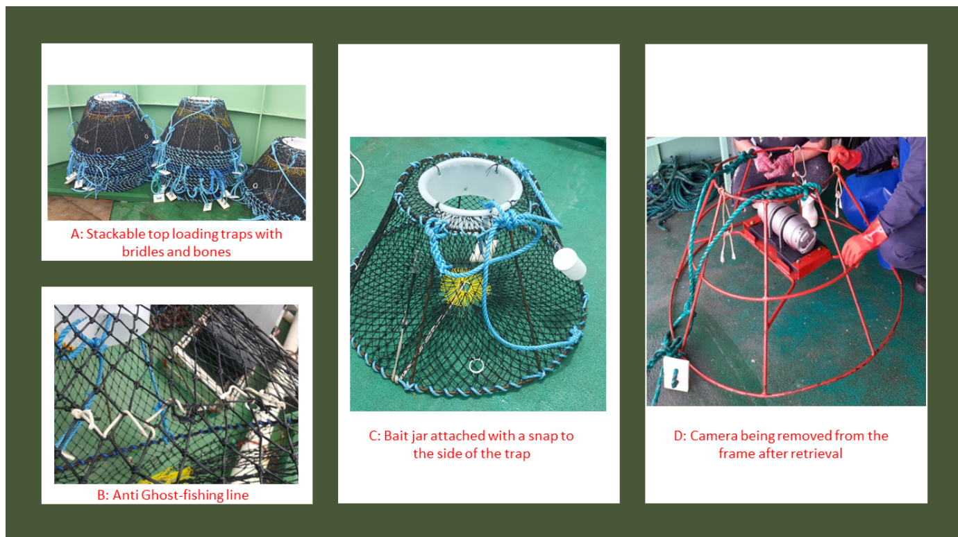
Figure A.3: Standard Type & Configuration to be used in the Exploratory Fishing Operations