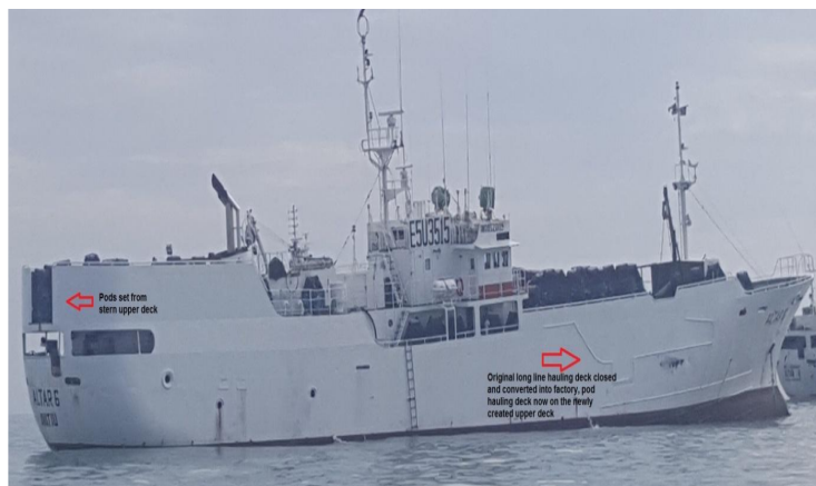
FV Altar 6 – Designated Exploratory Pot Trapping vessel (SPRFMO)